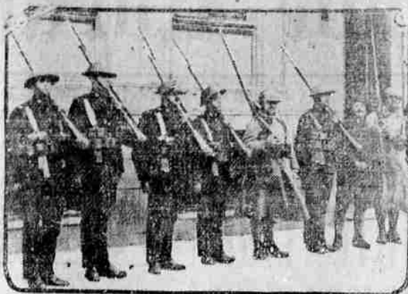
Control of Memel was vested in the League of Nations and exercised by this garrison of French marines and infantrymen. Here they are shown guarding the League of Nations headquarters before control of Memel passed into the hands of Lithuanian irregular troops.

THE L. L. DRUG CO. PRESCRIPTION DRUGISTS