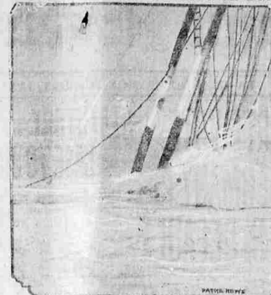
More than 2000 cases of whisky were a part of the doomed cargo of the British schooner which is shown here being pounded to bits on the sand bar off Montauk Point, N. Y.