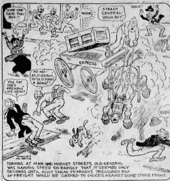
TURNING AT MAIN AND MARKET STREETS, OLD GENERAL WAS GAINING SPEED SO RAPIDLY THAT IT SEEMED ONLY SECONDS UNTIL AUNT SARAH FEARFULY TREASURED BOX OF FREIGHT WOULD BE DASHED TO PIECES AGAINST SOME STORE FRONT.