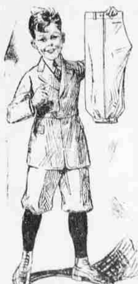
THE F.R. BRAND MANUFACTURED BY FELIX ROTHSCHILD & CO. CHICAGO

We would be glad to see all our friends and the public take full advantage of what we personally believe to be a Real Opportunity to Buy.