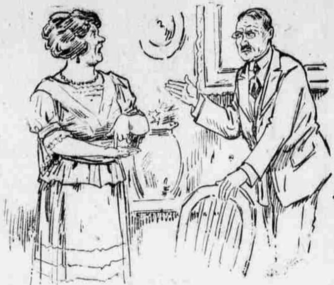
IT IS A WELL KNOWN FACT THAT A BUSINESSMAN WHO BELIEVES AT THE OFFICE IN THE REGULAR SERVICE AND LEAVES THE HOUSE WITH HIS MOUTH FULL OF TALK ABOUT HIS BUSINESS, IF HE TRIES TO PUT THAT SORT OF TALK OVER ON YOU, DON'T STAND FOR IT.