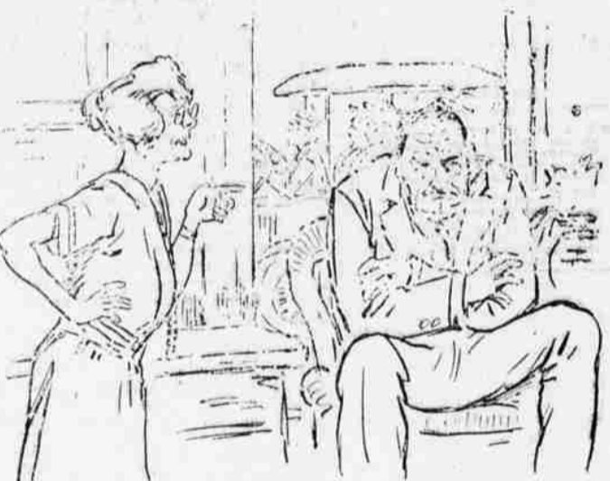
IF YOU FOLLOW THESE FEW SUGGESTIONS CAREFULLY YOU'LL SOON FIND THAT YOUR HUSBANDS LOVE WILL GROW STEADILY FOR SOME ONE ELSE.