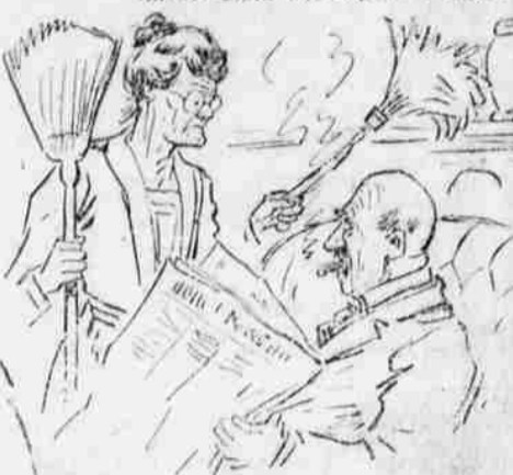
OVERSEEN NO OPPORTUNITY TO BRING HOME TO HIM THE FACT THAT HOUSECLEANING IS THE MOST IMPORTANT THING IN LIFE. DO NOT PERMIT A SPECK OF DUST ON THE FURNITURE OR COUNTENANCE THE MEREST SIGH OF CIGAR ASHES ANYWHERE IN THE HOUSE.