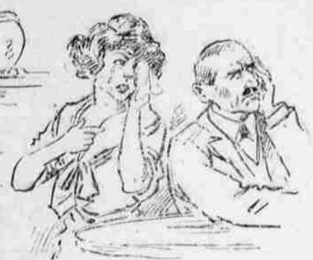
DO NOT FAIL TO BE BITTERLY SUSPICIOUS OF HIS SPENDING HIS MONEY IN A RETAIL STORE TO WHICH HE GOES. IF POSSIBLE, TRY TO CONVINCE HIM THAT YOU REALLY CARE FOR HIM.