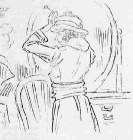
FREQUENTLY ASK HIM WHY "WE CANT AFFORD TO HAVE A NEW CAR LIKE THE JONESSES, ACROSS THE STREET - FUNNY WE CANT SPEND MONEY LIKE OTHER PEOPLE." REMEMBER THAT YOU CAN GET ALMOST ANYTHING BY CONSTANT NAGGING.