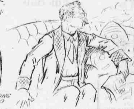
MAKE HIM TAKE YOU TO A PICTURE SHOW, A LECTURE OR A CONCERT EVERY EVENING THAT HE WISHES TO STAY AT HOME THIS WILL KEEP HIM YOUNG.