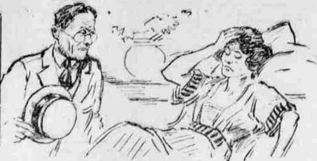
WHEN HE RETURNS ALL TAPPED OUT FROM WORK IN THE EVENING, RECEIVE HIM WITH THE ANNOUNCEMENT THAT YOU ARE COMPLETELY UPSET AND WORRY OUT AND THAT YOU CANNOT GET ALONG WITH THE Hired GIRL ANOTHER MINUTE.