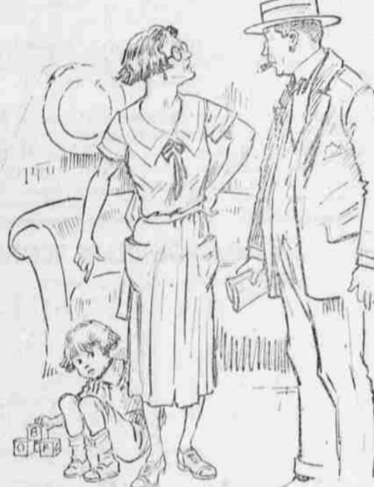
ANOTHER CHEERFUL WAY TO GREET HIM IN THE EVENING IS TO TELL HIM THAT HE MUST SHAVE TOMORROW WHO HAS BEEN A VERY BAD BOY. WONDER WHO THAT CHILD GETS HIS MEANNESS FROM ANYWAY? QUESTIONS OF THAT SORT WILL PUT DAD IN GOOD HUMOR.