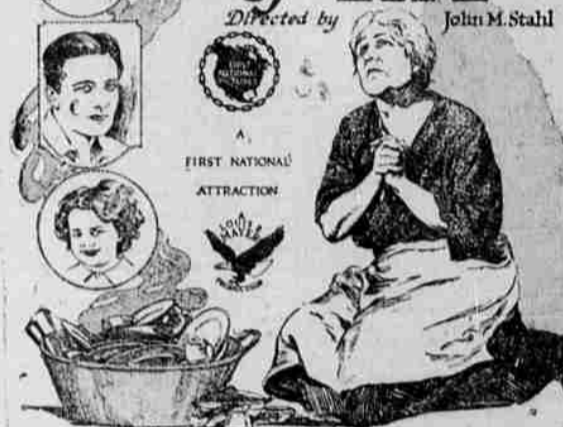
A Drama of Dishes and Discontent.