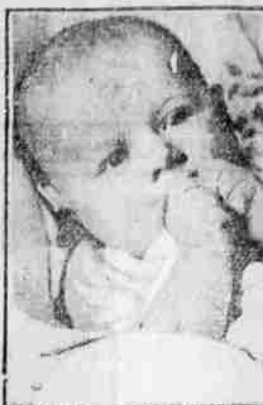
Probably this baby doesn't know he'll be a king some day. He's the Prince Michael, son of the crown prince and princess of Rumania.