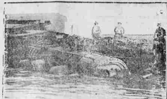
Here's what happened when a railway locomotive imagined it was a battleship and leaped into the Mystic River at South Boston, Mass. The crew leaped to safety and none was hurt. At the same time—