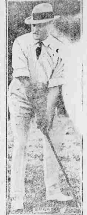
It's safe for General John J. Pershing to take his coat off when he plays golf for he hasn't any superior officer to come along and tell him so.