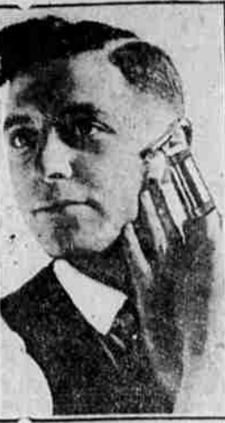
This flashlight razor takes the edge out of shaving in the dark. The handle is a lamp and throws a brilliant glow on the face.