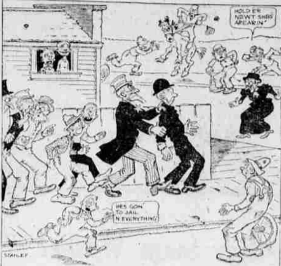
WHAT WILL THE BRIDE TO BE SAY WHEN SHE SEES HER NOBLE LOVER, MADSHALOTRY WALKER ESCORTING THE SUSPICIOUS STRANGER OFF TO THE CALABROOZE?

ley will appear for Cove tomorrow. They will appear on the program of the Epworth League entertainment to be held in Cove tomorrow evening with several musical numbers.