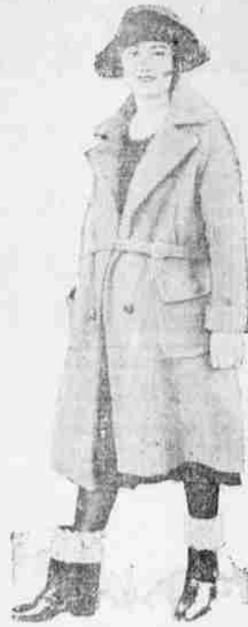
Here's the way the flapper will spend winter. Notice that the goloshes after the boots, fur-topped, are replaced by the well-known wooden shoe, original insignia of the flapper.