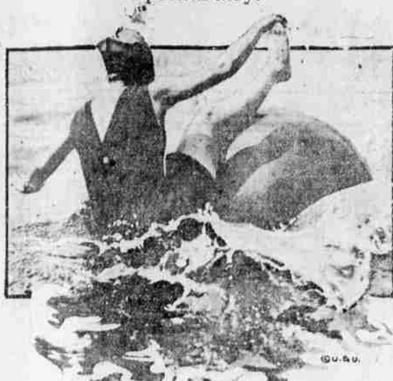
She tried to sit on top of a mammoth ball in the water, but it rolled right out from under her. This happened at the Luther Gulick Camp at Lake Selma, Me., in a water carnival in which 100 girls from 13 states participated.