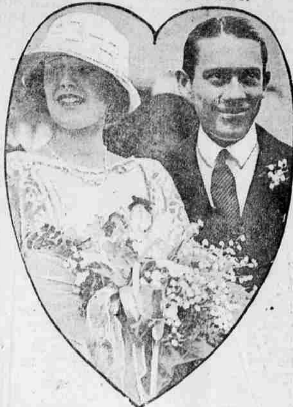
A close-up of Marilyn Miller and Jack Pickford taken just after the ceremony that made them man and wife and before the strains of the wedding march had died out.