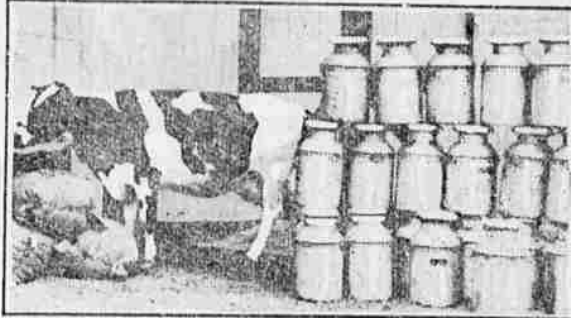
This Holstein cow on the government farm at Beltsville, Md., produced 25,000 pints of milk last year. It takes those 21 cans to hold her supply of milk for one month, 2677 pounds.