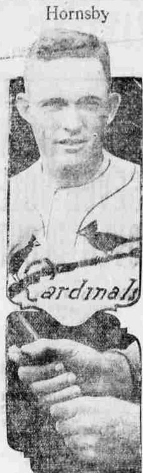
Rogers Hornsby, of the St. Louis Cardinals, considered by many the best all-round ball tosser that ever wore spikes. He's out after the home run title this year. Those big hands tell the story of his batting and fielding prowess.