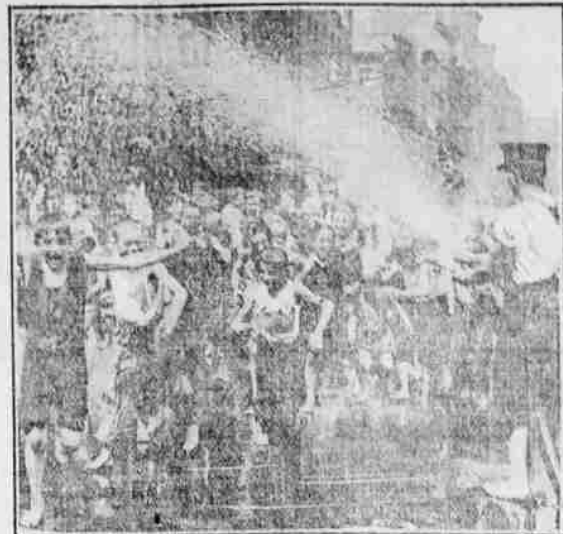
Kids living near the Henry Street Settlement, New York City, can't afford to leave their news stands and other flourishing business establishments to go to the shore, so friendly business give them a daily shower.

Kids living near the Henry Street Settlement, New York City, can't afford to leave their news stands and other flourishing business establishments to go to the shore, so friendly business give them a daily shower.