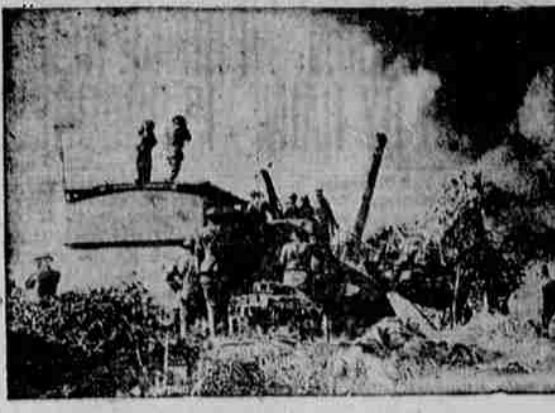
BIG "GUN" IN ACTION—SCENE FROM "POWDER RIVER"

A mighty volcano spewing a flaming torrent of lava toward the heavens; an earthquake that rocks the countryside for miles and send buildings crashing to the ground in a thousand fragments; fleeing natives, in a state of panic, running wild-eyed for safety in the outlands! This is but a short word picture of one of the great big thrill episodes that make "The Vermilion Pencil," one of the really important motion pictures of the day. It is shown for the first time today at the Sherry Theatre, where its engagement will last for two days.