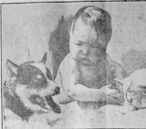
This naked Eskimo baby is nestling in his dog's catch of fire in an igloo, or house of ice, where temperature's below freezing. His playmates are sled dog pups.