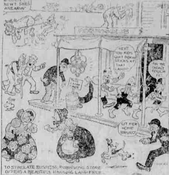
TO STIMULATE BUSINESS, ROBINSON STORE OFFERS A BEAUTIFUL HANGING LAMP FREE.