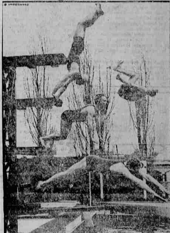
They jump right in—these early spring British swimmers—even if the water is icy cold. It's at the Chiswick open air baths.