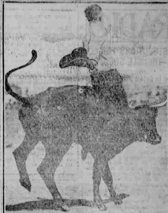
Without saddle or bridle, this cowboy is riding a steer for the amusement of onlookers at a Los Angeles wild west show.