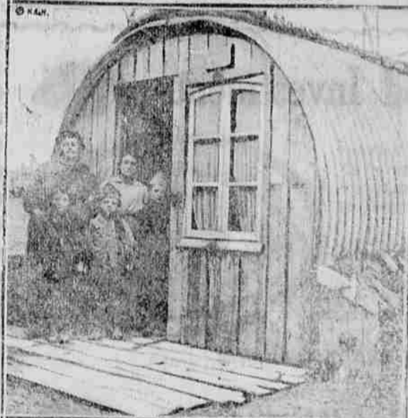
This French family in the devastated region seems happy in its improvised home of battlefield odds and ends. Thousands of families occupy similar quarters.