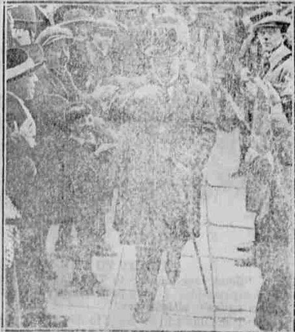
Applauded by street throng, Arthur Griffith, Irish Free State chief, arrives at the Mansion House, Dublin, in time for an association to end Irish partition meeting.