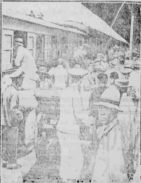
Thousands of children are fleeing to Peking, since Wu Peifu has ordered the burning of Tientsin. Here are some of the early arrivals.