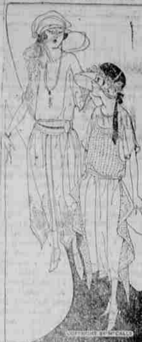
Beaded gowns with Oriental patterns are becoming popular. Bright shades of iridescent beads are most common. Cut steel beads lead in favor.