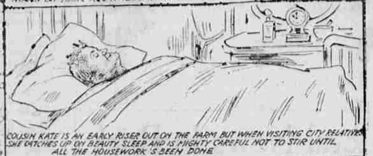
"COUSIN KATE IS AN EARLY RISER OUT ON THE FARM BUT WHEN VISITING CITY RELATIVES SHE CATCHES UP ON BEAUTY SLEEP AND IS MIGHTY CAREFUL NOT TO STIR UNTIL ALL THE HOUSEWORK IS BEHIND HER."