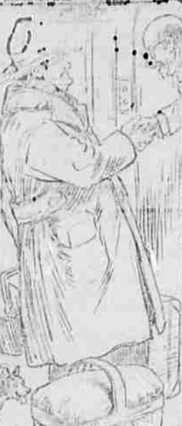
"RURAL RELATIVES ARE ALWAYS MOST WELCOME, SO IS THE RECEIVED CHICKEN, BAKED SAUSAGE HOME-MADE JELLY AND WHATEVER ELSE THEY MAY SEE FIT TO BRING ALONG."