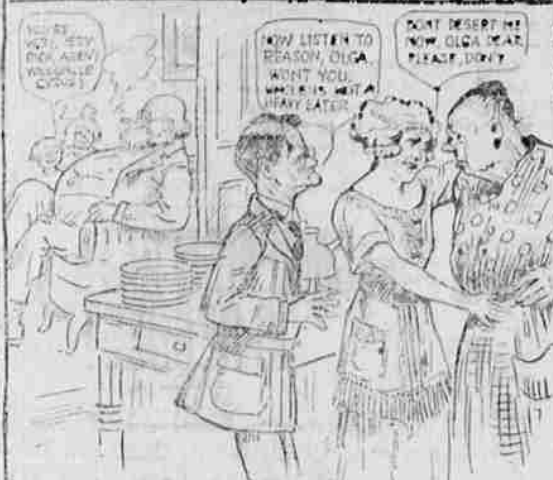
"AND DID YOU EVER SEE IT FAIL THAT THE COOK GETS OBSTREPEROUS THE MINUTE YOU GET COMPANY."