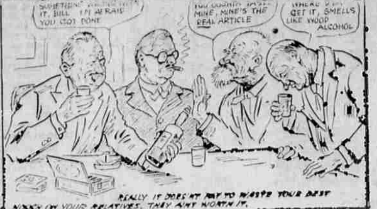
"REALLY IT DOESN'T PAY TO WASTE YOUR BEST MONEY ON YOUR RELATIVES. THEY AREN'T WORTH IT."