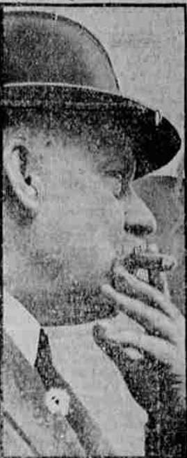
Secretary of War Weeks enjoys a cigar after one of the numerous banquets he is obliged to attend.