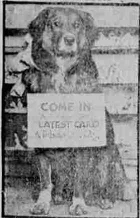
This dog poses for hours motionless as an advertising stunt in a New York toy shop window. "Pretty Boy" is his name.