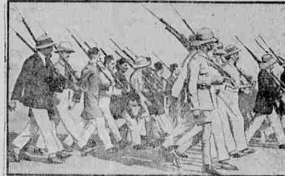
Parsons at Bombay, India, being trained in the manual of arms to combat followers of M. K. Gandhi, Nationalist leader, in an open revolt comes.