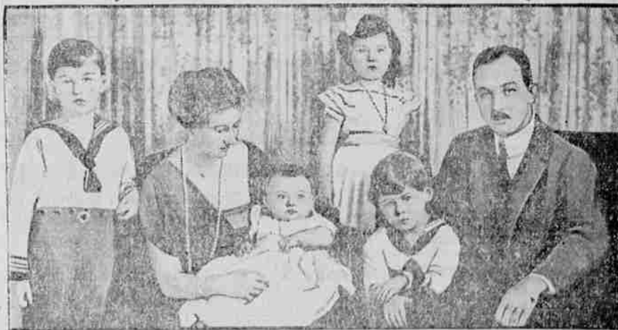
A new picture of the daughter of the former German emperor and her family. She is the wife of the Duke of Brunswick and Lutzenberg, German nobleman.