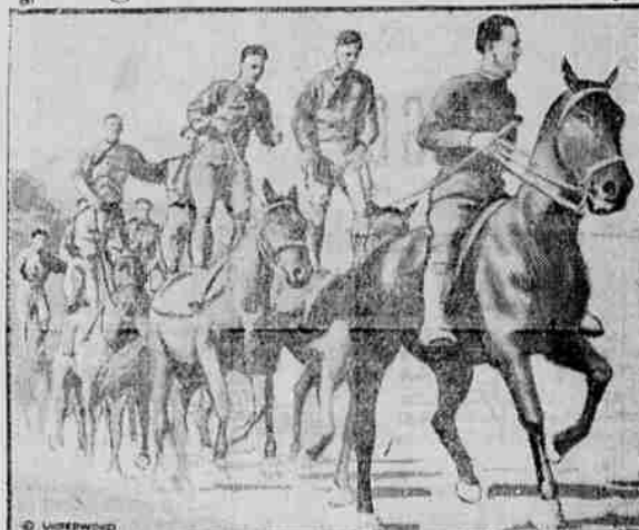
Standing on the sweat-slippery backs of their mounts the 11th U.S. Cavalry comes thundering down the road in a cloud of dust in an exhibition of horsemanship. If a foot had slipped or a steed had stumbled—