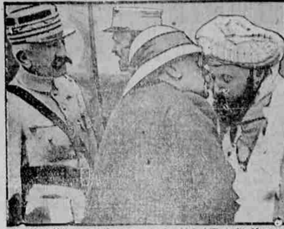
President Millerand of France greets the chief of Timhadit, Moroccan village, in typical French style.