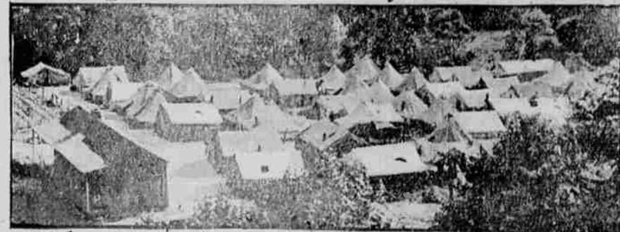
Enforcement of the order of the federal district court at Charleston, W. Va., means the eviction of 200 families of union miners from tent colonies in Mingo county, W. Va. The tents were furnished two years ago by the United Mine Workers when the miners were evicted from their homes.