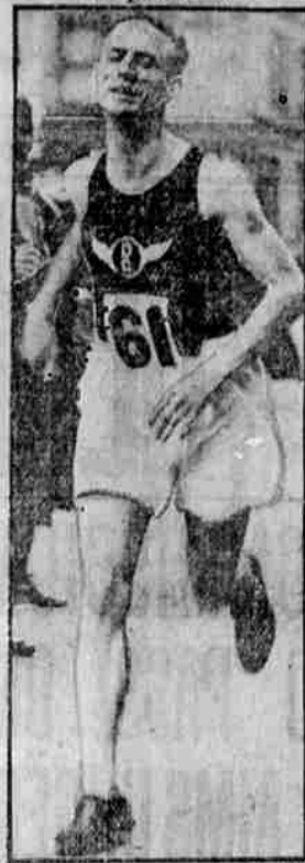
Clarence H. De Mar winning 26th annual American Marathon in Boston. His record breaking time was 2 hours 18 minutes 19 seconds. He won the event in 1912.

most beautiful Queen and King Ferdinand. The Rumanian parliament has appropriated a vast sum for the event. Most of the reigning sovereigns and heads of state throughout Europe have been invited. It is hoped here President Harding will send someone to represent the United States.