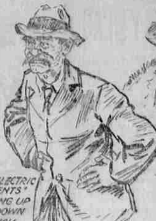
HAS ELECTRIC CURRENTS RUNNING UP AND DOWN HIS BACK AND WANTS MAYOR TO STOP IT. (WHITE MULE)