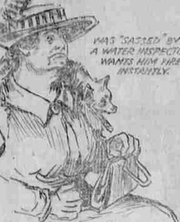
WAS STARTED BY A WATER INSPECTOR WANTS HIM FIRED INSTANTLY.