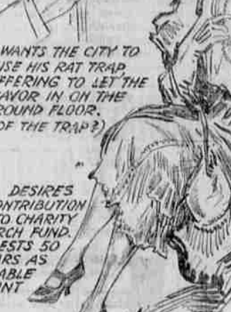
DESIRES CONTRIBUTION TO CHARITY CHURCH FUND. SUGGESTS 50 DOLLARS AS A SUITABLE AMOUNT