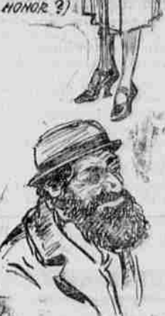
WANTS A FOOT PEDDLER'S LICENSE.