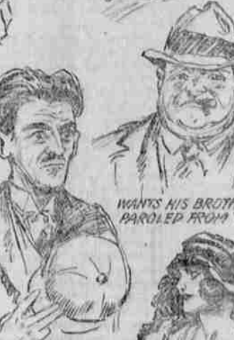
WANTS HIS BROTHER-IN-LAW PAROLED FROM THE WORK-HOUSE