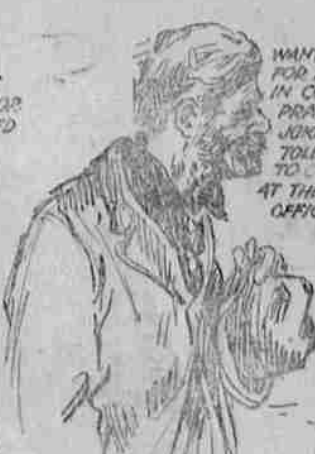
WANTS PAY FOR PUTTING IN COAL FOR PRACTICAL JOKER WHO TOLD HIM TO COLLECT AT THE MAYOR'S OFFICE.