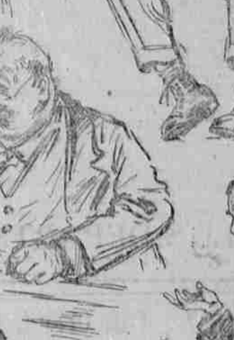
STRANDED IN CITY WANTS TRANSPORTATION HOME.