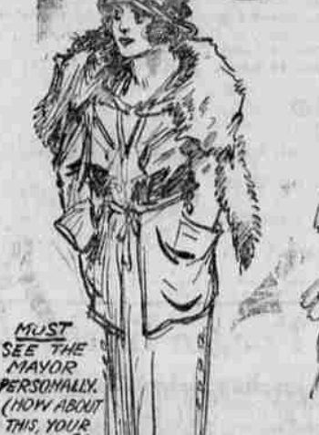
MUST SEE THE MAYOR PERSONALLY. (HOW ABOUT THIS YOUR HONOR?)