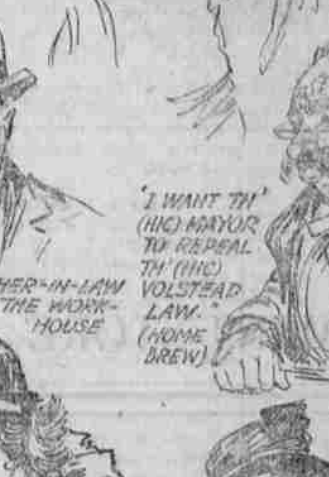
'I WANT TH' (HIC) MAYOR TO REPEAL TH' (HIC) VOLSTEAD LAW.' (HOME BREW)