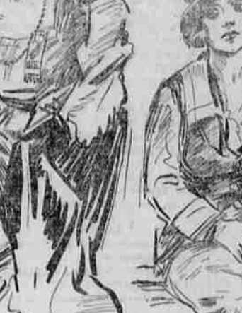
WANTS THE CITY TO USE HIS RAT TRAP OFFERING TO LET THE MAYOR IN ON THE GROUND FLOOR. (OF THE TRAP?)