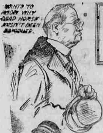
WANTS TO KNOW WHY DEAD HORSES DON'T GET BURNED.