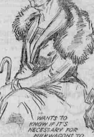
WANTS TO KNOW IF IT'S NECESSARY FOR MILKWAGONS TO MAKE SO MUCH NOISE EARLY IN THE MORNING