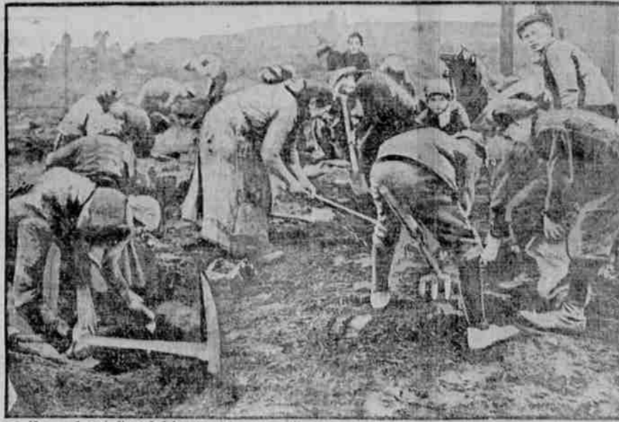
Hours of coal discarded because of poor quality in more affluent days are now being reclaimed in Germany because of the coal shortage. If the present coal strike in America endures similar scenes may be encountered here next fall.