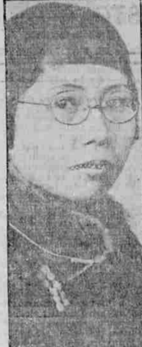
The recent convention of Mongolian communists at Moscow drew the attention of statesmen of all nations. This is a typical woman leader of the Mongolians.