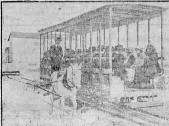
There are no short circuits on this line, except when it's time for Dohlan to put on the feed bag. This "rapid transit" is at St. Augustine, Fla. You can stand on the track and jump right to the front door when the car comes along.