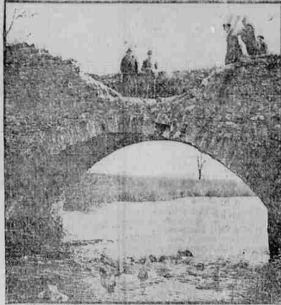
The Moyola Bridge was partially destroyed by bombs in a series of raids made by Sinn Fein forces at Masheera, County Derry.