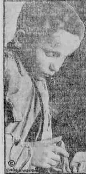
This six-year-old lad is just one of thousands of Polish orphans who earn their daily bread in factory work. This one gets 10 marks a day for making clay toys. That's about one-fourth of a cent.