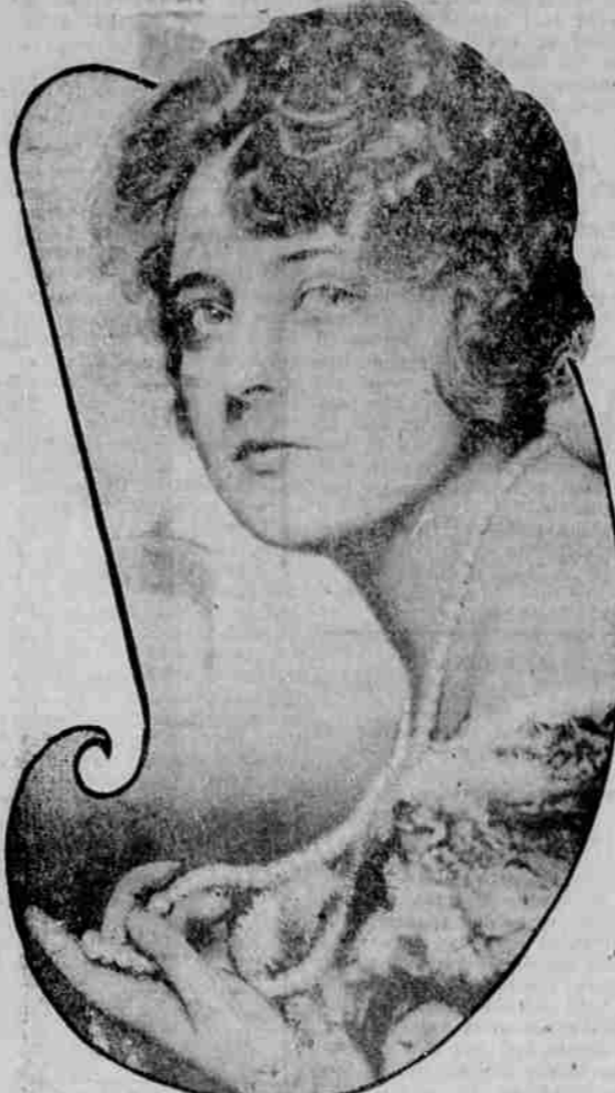
Ganna Walska, opera singer, and Alexander Smith Cochran, millionaire, are in the shadow of the divorce court. Their present difference is about money. Cochran's offer is $10,000 a year while Ganna is reported to be asking $500,000.