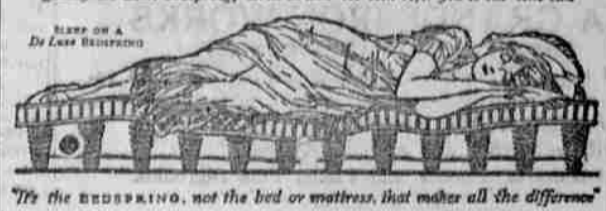
"It's the BEDSPRING, not the bed or mattress, that makes all the difference"

Note—Don't accept a substitute. If your dealer cannot supply you with a Rome Quality De Luxe Bedspring, write us and we will refer you to one who can.