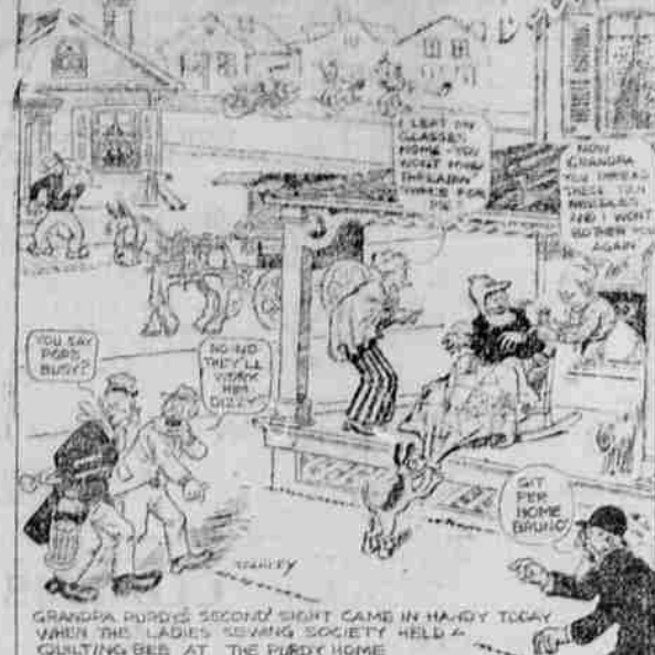
GRANDMA CURRY'S SECOND BIRTH DANCE IN HANDY TODAY. WAS THE LADIES SEWING SOCIETY HELD A GUILTING BEE AT THE PURDY HOME.

charity for all,"—that was Lincoln. And that is the kind of rulership the world needs today. It needs statesmen not only possessing the sentiment of charity—which in a weak man becomes sentimentality—but men big enough and strong enough, like Lincoln, to go ahead and give its expression in national and international affairs.