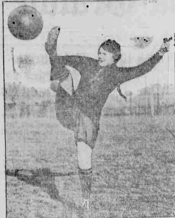
Two girl teams played football at Sudbury, England, in a match arranged officially to show whether the game is too much for girls. Photographs who made the test examinations voted in favor of play.

With a slight change in the table was a change in the table and when her husband was notified she and her husband were notified enthusiastically. It is a little bit of a joke, if there is one, but it is a little bit of a joke. Just think, if her husband had had a wife, it would be a joke.