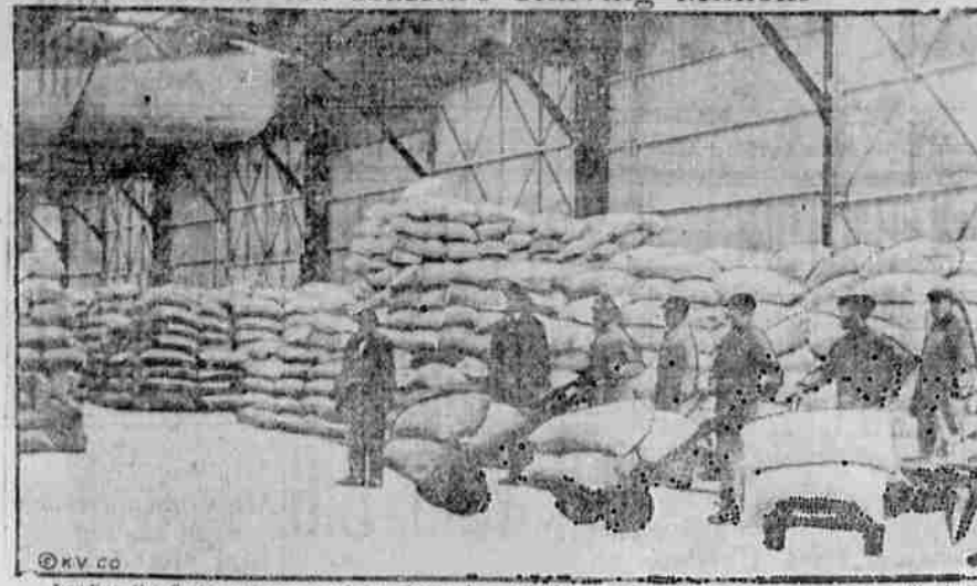
Loading the first consignment of American wheat which 12 ships, bound to the quayside, will shortly carry to feed the famine-stricken districts of Russia.

lost, 1,000; Stoddards, three won and one lost, 750; Union, two won and one lost, 550; Cougars, three lost and one won, 250.