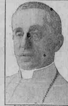
POPE BENEDICT XV