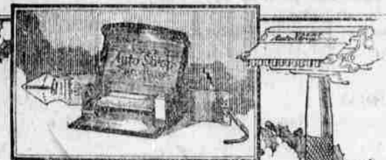
Silver plated razor, strap, year's supply of blades, in compact case, $5.00