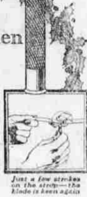
Just a few strokes on the auto—the blade is keen again