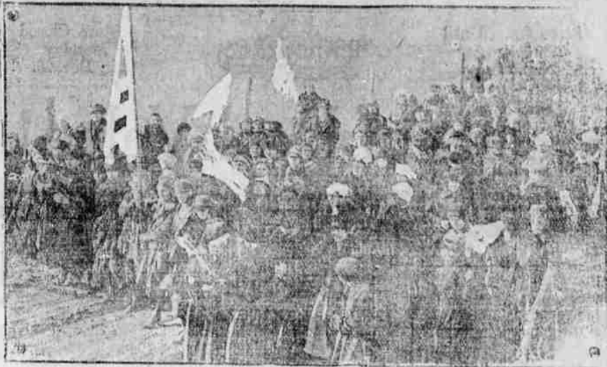
The army of 6000 wives and daughters of striking Kansas miners advancing toward the pits where men, obeying orders of the United Mine Workers of America, were at work. Waving American flags, laughing and jostling, they hauled out the "strikebreakers" and were not stopped until arrival of state troops.