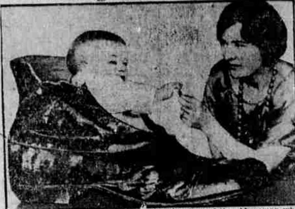
Just one baby fills this shoe, unlike the story of the old woman who kept her immense family in one. The kiddies were put in big shoes for a benefit at the Queen's Hospital, London. Sybil Thorndike, the English, is entertaining one shoe dweller.