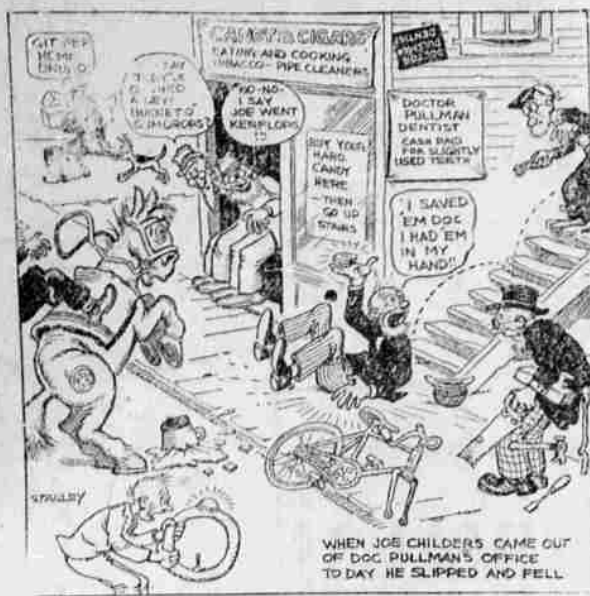
WHEN JOE CHILDERS CAME OUT OF DOC PULLMAN'S OFFICE TO DAY HE SLIPPED AND FELL

be all right, but tell me more about yourself."