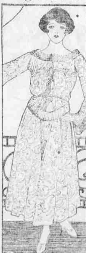
If your gown is expensive, you must refer to it as reflecting a Modern Age influence. If it is just a cheap affair you can let it go by talking about the Middle Ages. Anyway, the gorgeous Mary White costume is certainly suggestive of the Middle Ages. It is of heavy blue lace, with silver over silver trim. Sleeves and neck are outlined in silver material.