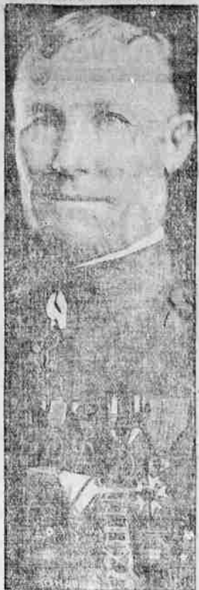
Sergeant Samuel Woodfill's light was turned "under a bush" till General Pershing, digging through dusty files, dragged him into the spotlight. He picks Woodfill as the greatest war hero even ahead of Alvin York. This Indiana soldier will represent the infantry at the burial of the Unknown Soldier.