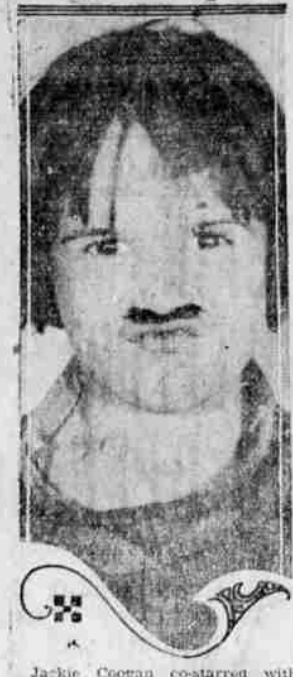
Jackie Coogan costarred with Charlie Chaplin in "The Kid." Now is a star in his own right in "My Boy." And he wears a Chaplin mustache!

They do not starve in Riga. Far from it.