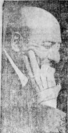
General Wu Pei-fu, post soldier and ruler of Italy, captured on a balcony of his villa at Gardone, northern Italy. He is watching sea-planes make for a cup he offered as