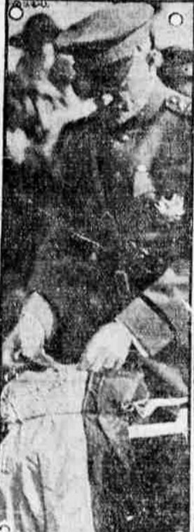
In an impressively simple ceremony under the Arch of Triumph, Paris, General Pershing bestowed the Congressional Medal of Honor on the unknown soldier of France.

containers at the University became known to those trying to solve the mysterious authorship of the remarkable childhood biography. But in spite of frequent opportunities to make public the contents of the three soap boxes, which were heavy as if packed with notebooks and school texts, the seals remained unbroken and the lids were undisturbed and