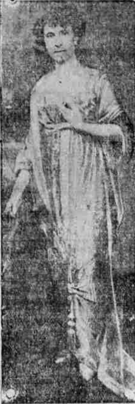
A new photo of Mrs. Harold F. McCormick, daughter of John D. Rockefeller. McCormick confirms the fact that they are living apart.