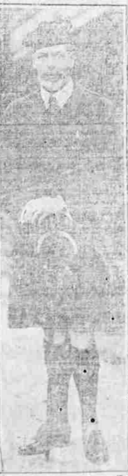
Here's the King of Bagpipers! He'll be playing in the first line of the band at the fair.