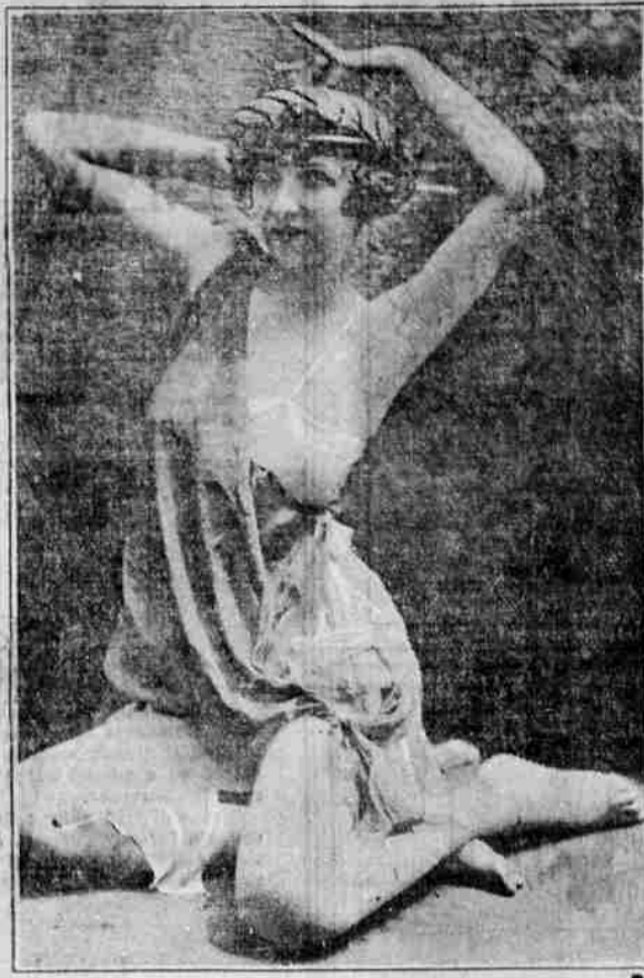
Here is Irene Castle as she appears in a dance in the forthcoming "French Heels," a movie in which she is starred. This is her first dance for steps of action in more than two years.