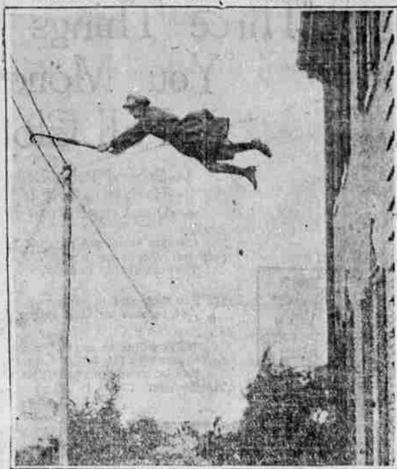
This man jumped from the roof of a house when villains, who sought his life, pursued him. He caught a telegraph wire with the crook of his umbrella and made his way to safety. This was a stunt in a detective story being filmed in Berlin. And the fellow who risked his life to do it was cast in ruckus.