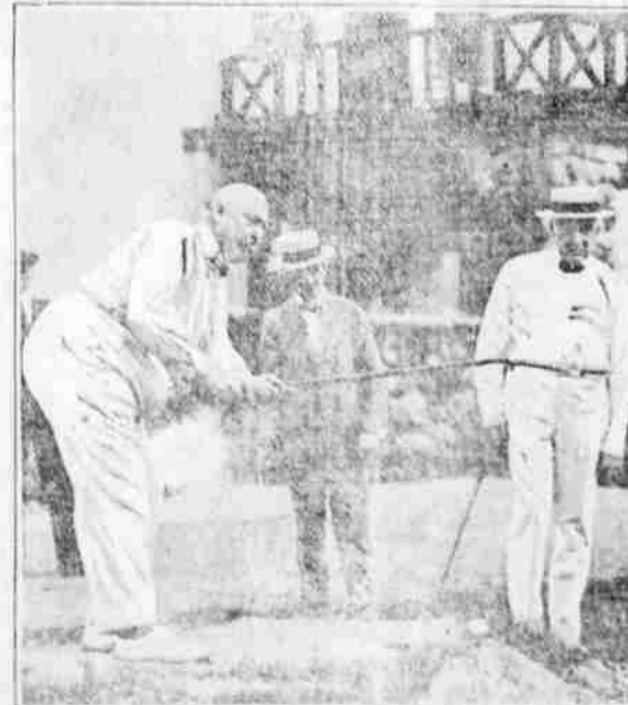
And now we have, not just golf, introduced by Secretary of War Weeks and the president himself. They arrange strange games. The rules are that each member gets by his own hands and only gets one permitted. But straighten up and—there you have it. Look for your self! Five see a golf ball that can't be hit. The game was taken at Weeks' mountain estate near Lancaster, N. H., where the president is spending a vacation.