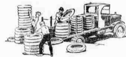
"Giving to the fabric tire user fresh, live tires. Being made now. Being shipped now."

In all of modern merchandising the biggest conundrum is the fabric tire situation.