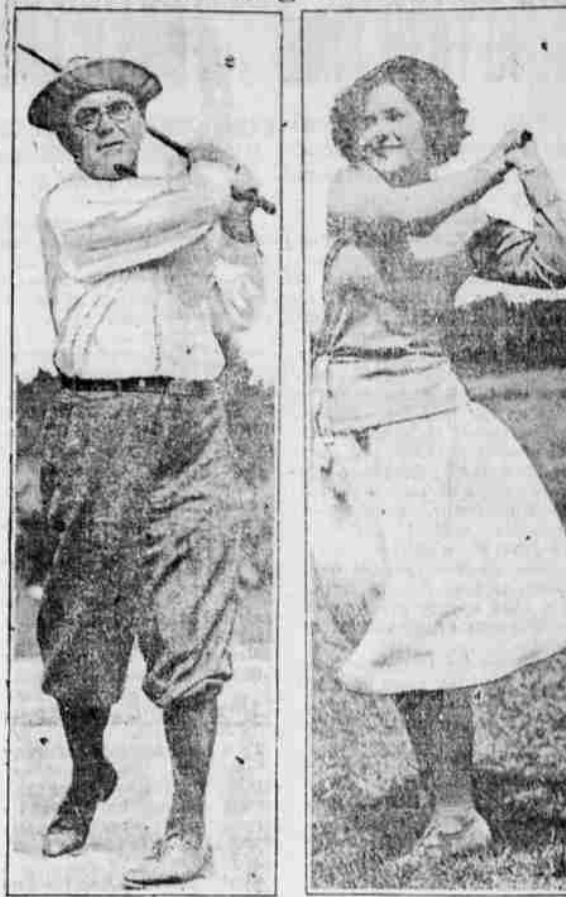
Henry C. Wallace and Norma Talmadge, two victims of the summer golf bug. Henry, the secretary of agriculture, affects the odd hit and the vigorous stroke on the links. Norma hopes to have sufficiently recovered from colitis to resume photoplaying in the fall.