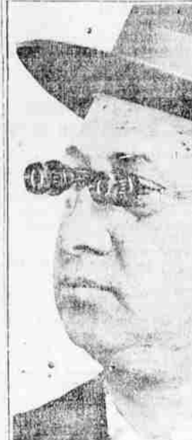
Here's the latest thing for those who watch the ponies run. The lens of the small field glasses are adjusted to the eye in the same way ordinary field glasses are. Your hand doesn't tire holding these.

BEFORE SCHOOL OPENS Is the Best Time to Buy Your Stationery.