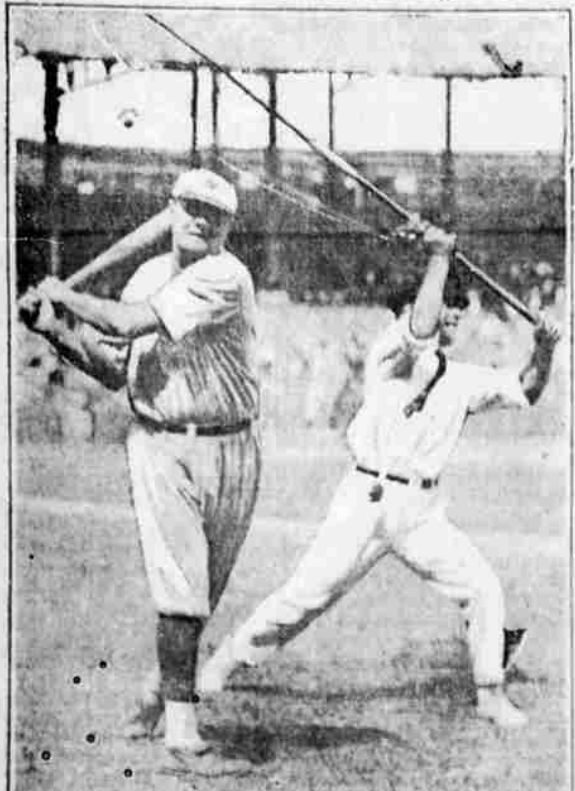
Harold G. Lentz, world's champion surf caster, tried to beat Lentz's surf record of 470 feet in a contest at the Polo Grounds. Lentz, using a four-course lead, cast 440 feet. The photo shows both in action.