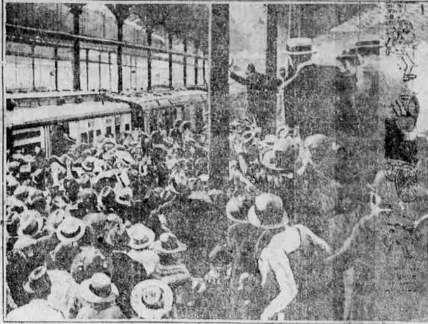
This picture, rushed from London, graphically shows how enthusiastic was the welcome given De Valera and his aids by Irish sympathizers when the Irish 'Peace Special' arrived, bringing De Valera for the conference with Lloyd George. This photograph was snapped in Euston Station, London, just as the Irish train came to a stop, the entire station was one dense mass of cheering humanity.