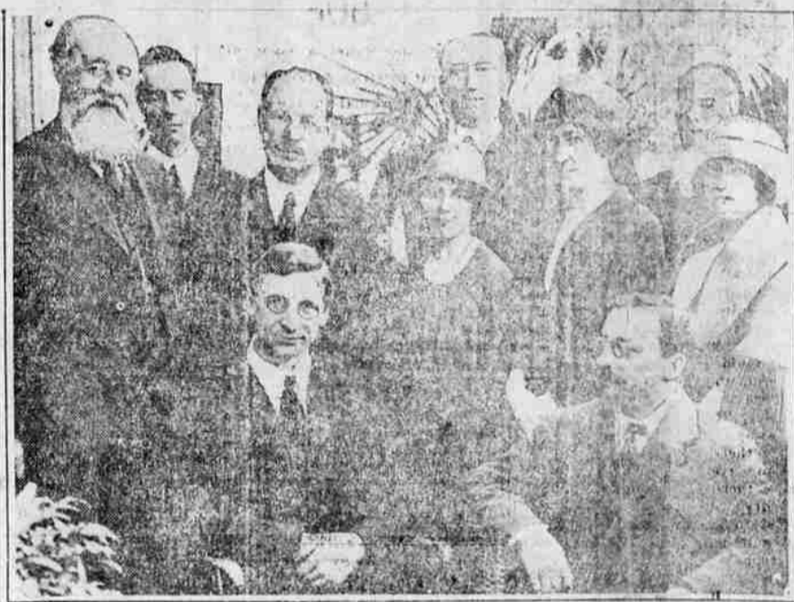
This is the first picture to reach America showing the Irish peace delegation at Irish headquarters in London for the momentous conference that may bring to an end